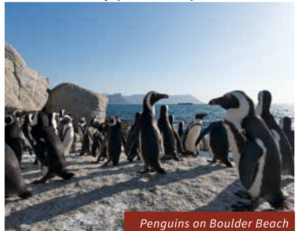
Penguins on Boulder Beach