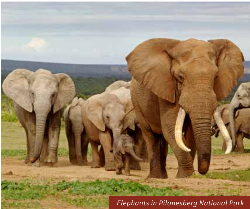
Elephants in Pilanesberg National Park

twice daily safaris take place at dawn and dusk, when the bush is at its most active and chances of spotting game the best. Your experienced ranger and tracker team will help you make the most of your time on the game drives through their extensive knowledge of the park. Safaris are conducted in open 4x4 vehicles which allow you a truly thrilling safari experience. During the heat of the day you can relax at the pool or soak up the sounds of the bush. (B, L, D)