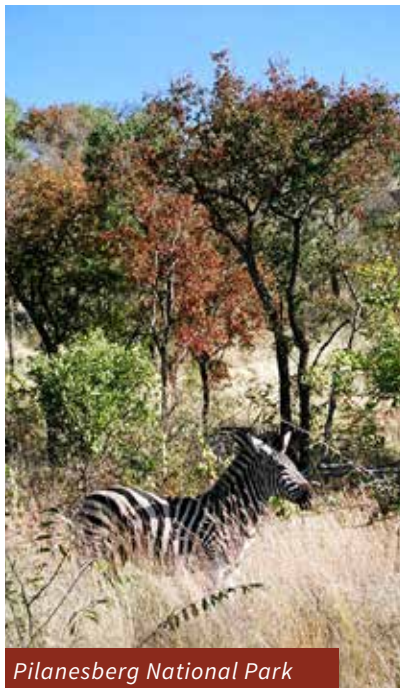
Pilanesberg National Park